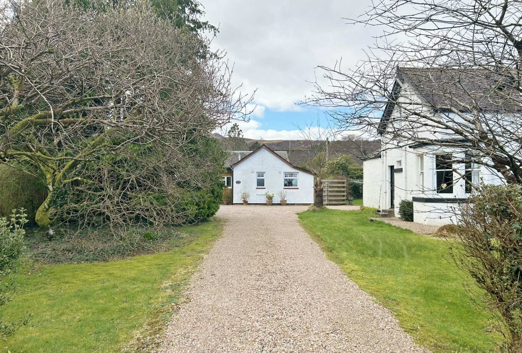
Greenways Cottage, Brodict, Isle Of Arran, KA27 8DW